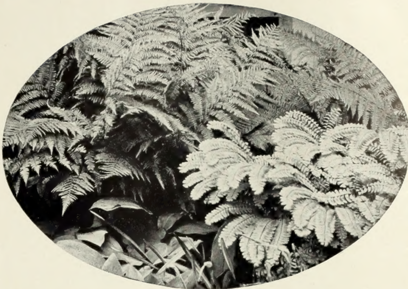
MAIDENHAIR AND LADY FERNS

OSTRICH FERN, Pteritis Nodulosa . This fern has graceful plumes, and grows in moist hollows and along the sunny brooks and ponds. It has plumes 4 to 6 ft. tall.